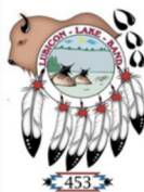
Lubicon Lake Band