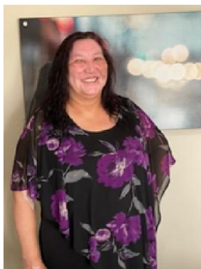
Trout Lake – MHR – Support Worker