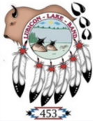
Lubicon Lake Band