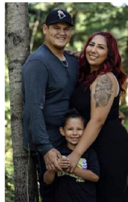
Loon River - MHR - Support Worker