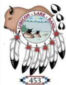
Lubicon Lake Band